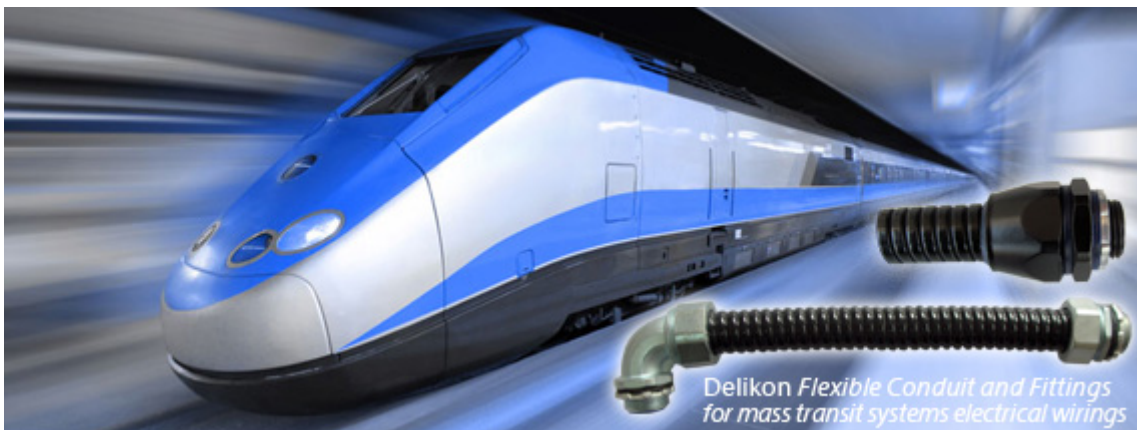
Delikon Flexible Conduit and Fittings for mass transit systems electrical wirings

Delikon Low Smoke Zero Halogen Jacketed Flexible Metal Conduit reduces the amount of toxic and corrosive gas emitted during combustion. The jacketing of this zero halogen flexible conduit is composed of thermoplastic compounds that emit limited smoke and no halogen when exposed to high sources of heat. LSZH, LSOH, LSOH, LSFH, OHLS flexible conduit is typically used in poorly ventilated areas such as aircraft, rail cars or ships. It is also used extensively in the railroad industry, where the protection of people and equipment from toxic and corrosive gas is critical like in the railway industry and shipbuilding industry.